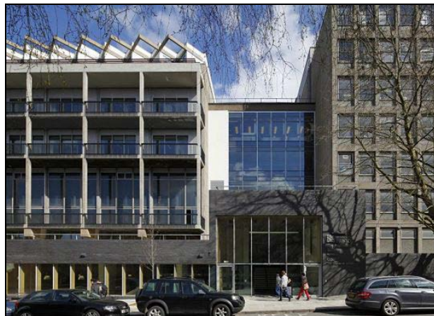
The Richmond Building - a vibrant, welcoming and sustainable facility for university students, staff and visitors

Phase 1 was completed in February 2013, and internal works on the North Block are now complete. Phase 2 works on the South Block are due to be completed in Autumn 2014.