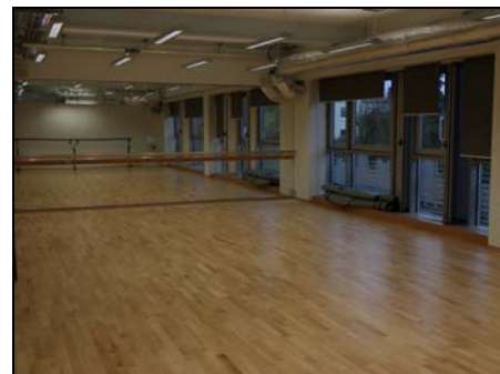
Newly refurbished spaces in the North Block including the Anson Rooms, the upper ground floor, and the dance studio