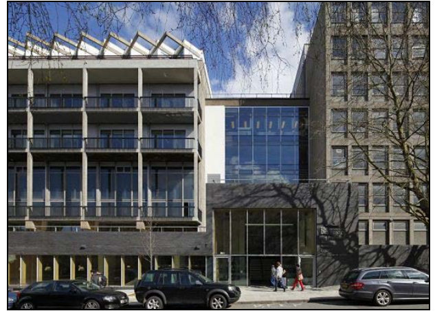
Transforming a very large, tired 1960's concrete building into a vibrant, welcoming and sustainable facility for university students, staff and visitors

Phase 2 works will run from April 2013 until Autumn 2014. Work on the North Block is targeted to be complete by October 2013. The South Block works including asbestos removal is anticipated to run from June 2013 until Autumn 2014.