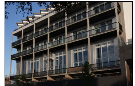
Phase 2 refurbishment: New Mandela bar starts to take shape, flooring installation and Queens Road elevation