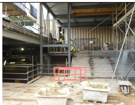
Queens Road entrance underway