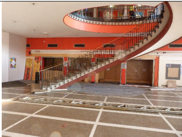
Foyer – as works started

The newly refurbished foyer was completed and ready on 1 October in time for the start of the new academic term and is looking magnificent. Around 6,000 students visited this year's Freshers Fair which took place on 4 th & 5 th October in the Richmond Building and the Victoria Rooms. The primary entrance to the Richmond Building has now reverted back to Richmond Hill Avenue and will remain so until January 2013 when the new Queens Road elevation entrance is due to be finished. The current Cowlin phase of works will be completed in February 2013.