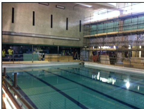
Ongoing works to the pool

Work is gearing up for the swimming pool to open in January 2013 when the works to the new changing facilities and access from Queens Road will be in place. From November there will however be some limited use by societies and external members, with access from Richmond Hill Avenue.