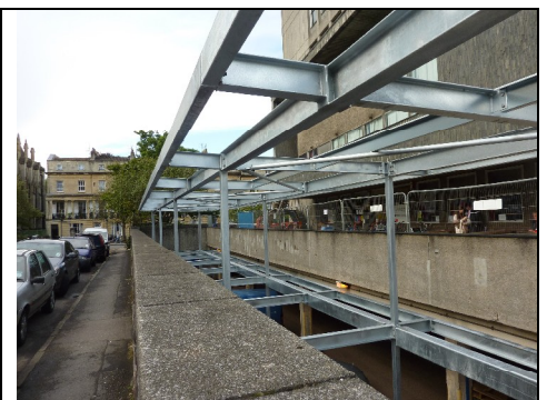
New bike store on Gordon Road