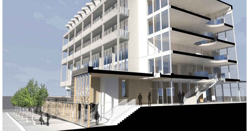
Concept view (Feilden Clegg Bradley Studios)

Over a number of construction phases the project will create new spaces for existing activities, including the Students' Union, Anson Rooms and swimming pool; and new facilities including the International Foundation Programme.