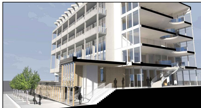
Concept view (Feilden Clegg Bradley Studios)

Over a number of construction phases the project will create new spaces for existing activities, including the Students' Union, Anson Rooms and swimming pool; and new facilities including the International Foundation Programme.